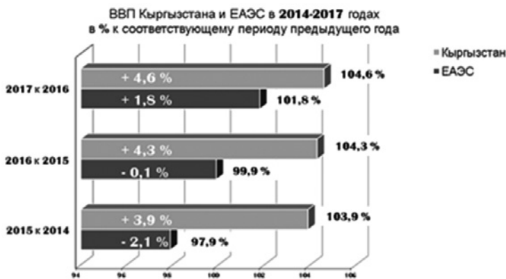
Figure 2. The GDP of the Kyrgyz Republic in 2014–2017

Kyrgyzstan is one of the leaders in economic growth among the EAEU countries according to Arzybek Kojoshev, the former minister of economics of the KR (Kojoshev, 2018). He also added that the inflation rate for the three-year period in the EAEU did not exceed 5%. The positive dynamics of economic growth in 2015-2017 (average 4%) is another good indicator. The growth of turnover during this period was 15% and the garment industry was developing at especially fast pace.