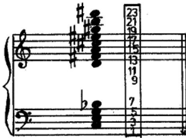
Example of the score Nr 3. E. Suchon, Akordika , p. 17

Eugen Suchon approaches his harmonious thinking in his theoretical work Akordika 45 . In it he focuses on the development of harmonious thinking in the music of 20 th century, and at the same time he theoretically elaborates mainly his own harmonious acts 46 . His theory of diatonic total relies on higher harmonious tones. In his choral thinking Suchon relies on the chords of thirds structure using all 32 harmonic tones with understandable omission of recurring tones, on the basis of what he gains 12-tonal sound which he denotes as synthetic 12-tonal sound. This is the starting point of his choral thinking that approached the technique of twelve-tonal sound technique and all choral forms are derived from that: