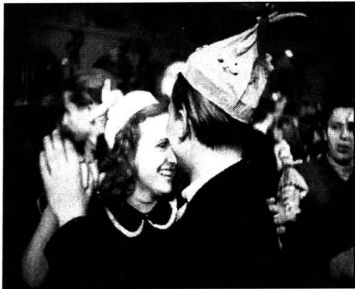
iii. 11 The New Year's Eve Ball, a scene from an original newsreels of the 1950s, inserted into Architects of Our Happiness