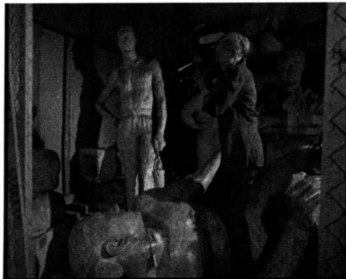
iii. 6 Agnieszka is filming the fallen statue