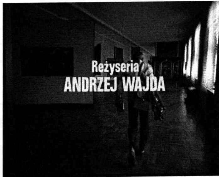
iii. 1 Man of Marble Credits