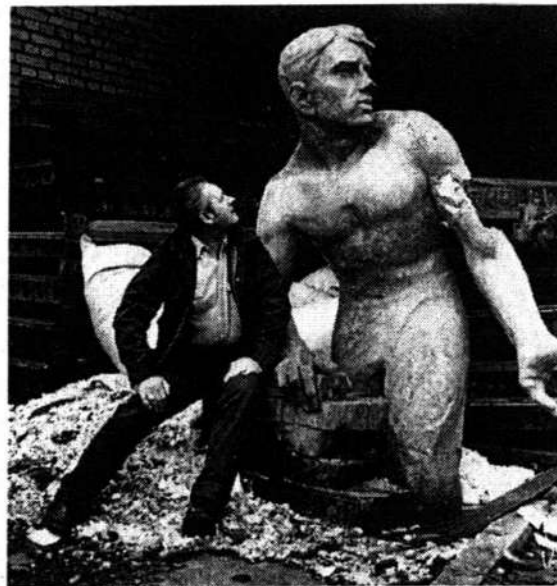
iii. 4 Julien Quideau, Andrzej Wajda and the mock statue of the Man of Marble at the Documentary Film Studios, Warsaw, 1980