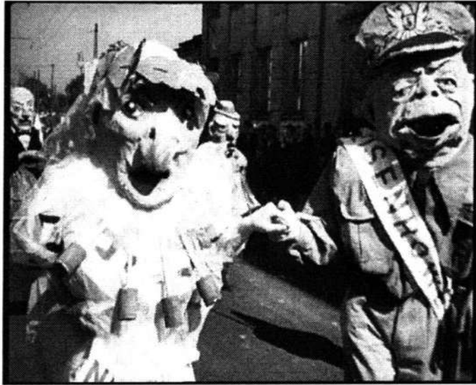
iii. 10 'Trumanillo Circus' during the May Parade in Warsaw, a frame from an original newsreel of 1951 inserted into Architects of Our Happiness