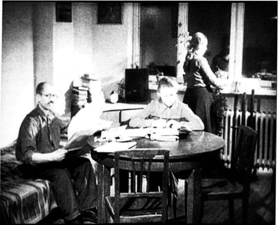
iii. 12 Interior of the workers' flat, a scene from an original newsreel from the 1950s, inserted into Architects of Our Happiness

This brings me back to the issue of socialist realist art and its return to museums as well as to academic discourse, in the aftermath of the film. Seven years ago I read the film as a powerful stimulus to a debate on the obliterated pages of Poland's Stalinist history. 25 The opening episode of the discovery of the fallen statue, clear of any detectable parody and therefore not allowing for the establishment of a safe distance between the represented, the representant