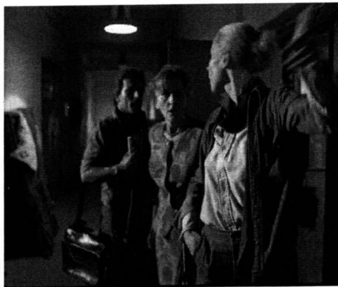
iii. 2 Entering the Museum Storage