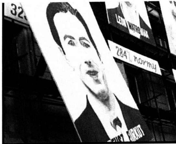
iii. 8 Birkut's gigantic image is taken down from the streets of Nowa Huta after his downfall