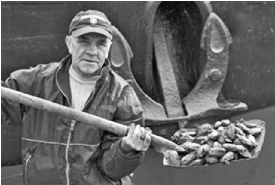
Photo 1. Employee of a company extracting gravel from the river in Fordon - Bydgoszcz (100 km below the dam) helping molluscs to return to water - May 2007. Molluscs were aground due to the lowering of water flow at the dam in Włocławek to the value below biological flow.

In May 2007 the new repair-intervention regime of Włocławek dam operation caused ecological catastrophe on the lower Vistula. After supplying the channel for the purpose of navigation it took an hour to replenish the deficiency of useful capacity in Włocławek Reservoir. In order to achieve it, the level of water below the dam was lowered to the level of biological flow. Additionally, discharge was ceased for approximately six hours (due to planned maintenance works on the check dam stabilizing the lower weirs and the power plant). Overlapping of these two factors caused considerable lowering of the water stages on the reach between Włocławek and Grudziądz, which lasted approximately 10 hours. All aspects combined resulted in great fish and molluscs mortality (photo 1).