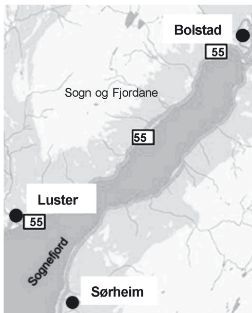
Fig 1. Location of the investigated plots in Sogn og Fjordane ( http://maps.google.pl , modified)

The building roofs with rock slates and moss were chosen for this study in 3 towns of Sogn og Fjordane in Norway (Fig. 1): Bolstad (61°29.43'N, 7°35.45'E), Luster (61°26.33'N, 7°27.21'E), and Sørheim (61°25.21'N, 7°29.30'E). All the roofs were situated at 30–65 m a.s.l., had a south exposure. Moss covered 100% of roof areas, with dominant Polytrichum sp., while Hypnum sp. was less abundant.