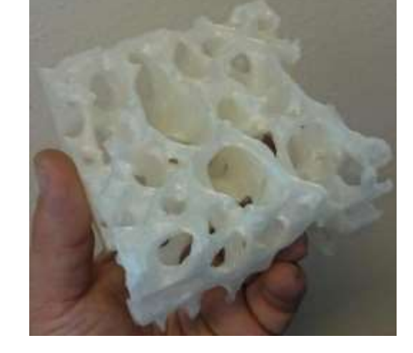
Fig 1. Example of application of the reverse engineering: a) bone, b) its digital visualization, c) its 3D-prints in various scales